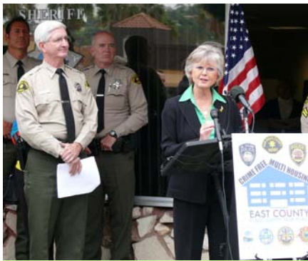
Home Safe Home: The East County Public Safety Task Force celebrates the Crime Free Multi-Housing program.

Three cheers for Crime Free Multi-Housing! This innovative program is earning accolades for turning crime-plagued rental complexes into safer, happier homes.